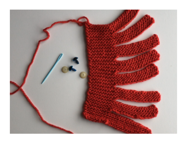
Just after "bind off"